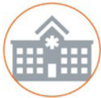
Place of Birth