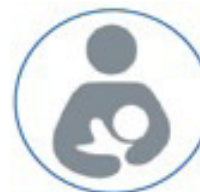
Maternal Breast Milk

Statement on Inclusive Language and Practice. The North West Neonatal Operational Delivery Network (NWNODN) and the North West Coast and Greater Manchester Safety Patient Collaboratives are aware that the use of gendered language such as mother, woman and maternal, as well as breast and breastmilk feeding, can make some families feel excluded. When we use these words in this document, we are referring to all birthing people and parents, regardless of their gender identity. When supporting individual families, professionals are encouraged to use the terms that the family identifies with, as well as their desired pronouns.