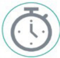
Optimal Cord Management