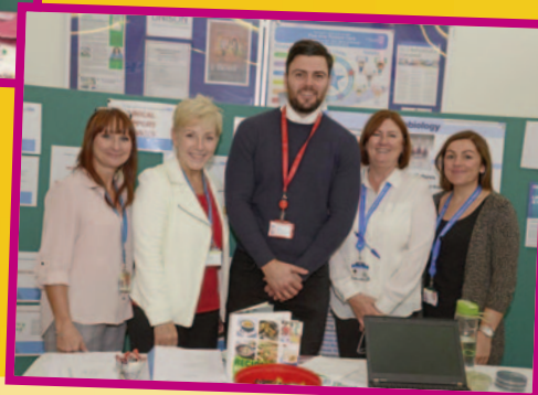
Staff showcase their work at the AGM