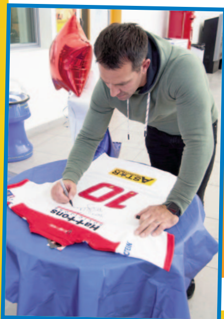
Saints legend Paul Sculthorpe signing a special '10' rugby shirt