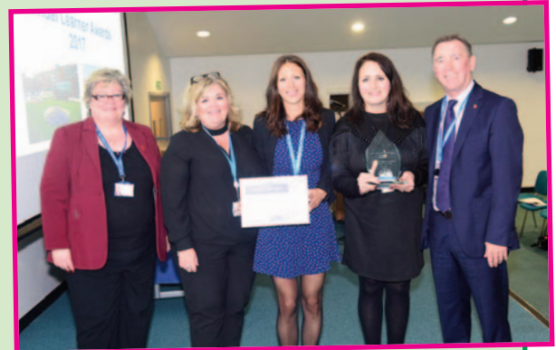
Team of the Year – IT Training Department