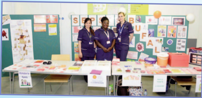
Members of the team at the Sepsis September Awareness Day

Sepsis is a rare but serious complication of an infection. Without quick treatment, sepsis can lead to severe and life-threatening complications. The team's aim is to provide early intervention for patients admitted with signs of sepsis and increase awareness of the disease across the Trust.