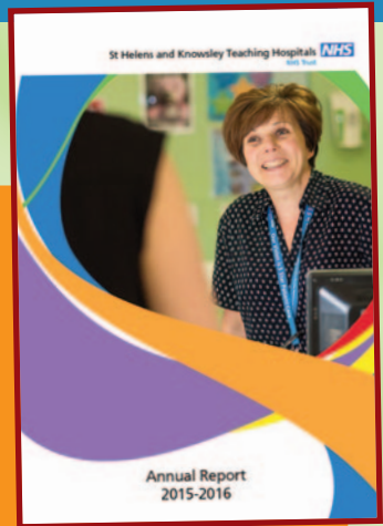
Annual Report 2015 – 2016