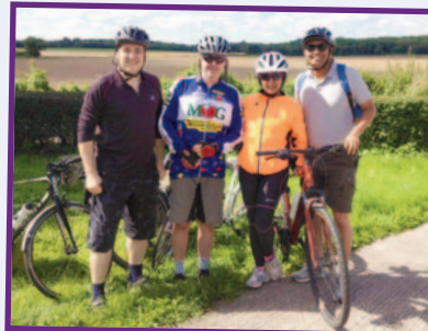
The cycling Breast Team

Breast Cancer Survivors' Dragon Boat Team) and Amathus Dragon Boat Club.