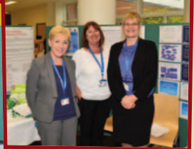
The Trust Roadshow