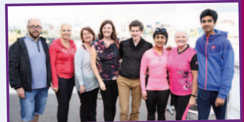
Members of the Breast Team and supporters at the Dragon Boat Taster Day

The team also took part in a Dragon Boat 'Taster Session Day' in October, visiting Queen's Dock Watersports, to see Liverpool's 'Pool of Life' (a