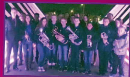
St Helens Youth Brass Band perform on the pink Steve Prescott Bridge