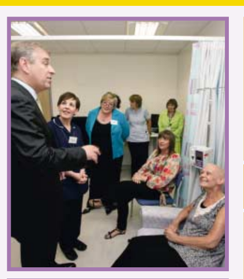
His Royal Highness chatting with patients on the Lilac Centre