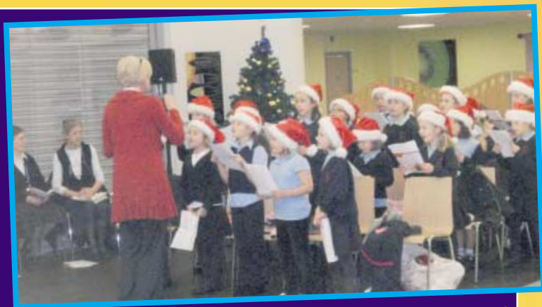
The children of Robins Lane Community Primary School singing at St Helens Hospital