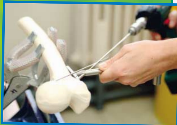
Drilling into a model of a femur (hip bone)