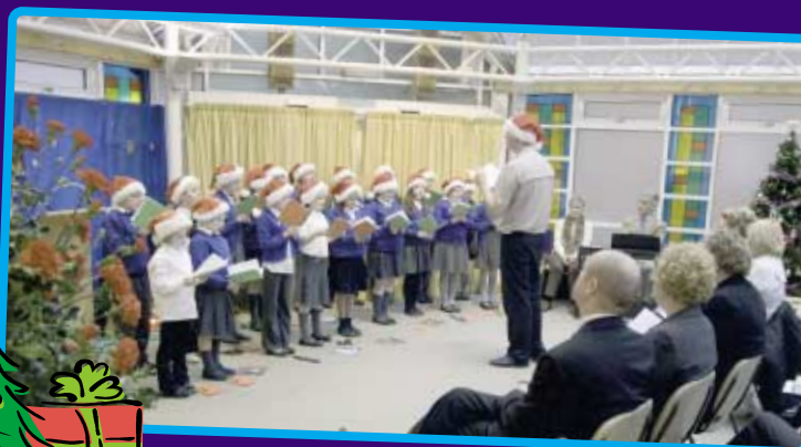
Children from Whiston Willis Community Primary School Children entertaining the audience in the Chapel at Whiston Hospital