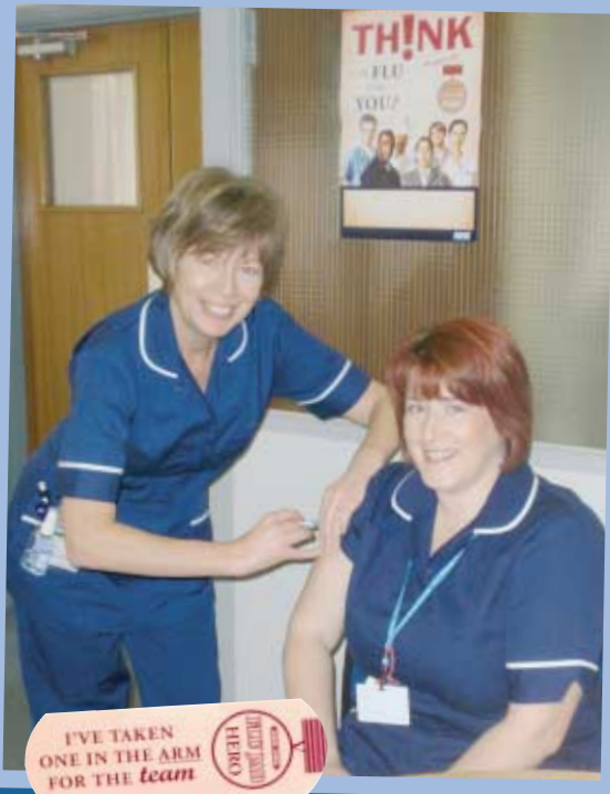
Swine flu vaccinations in full flow

In line with Department of Health guidelines staff working in high risk clinical areas such as Accident & Emergency, Intensive Treatment Unit, Maternity, Paediatrics and Respiratory have been given the vaccine first. Now the Trust is opening up the vaccine to all other areas and giving other staff the chance to be vaccinated.