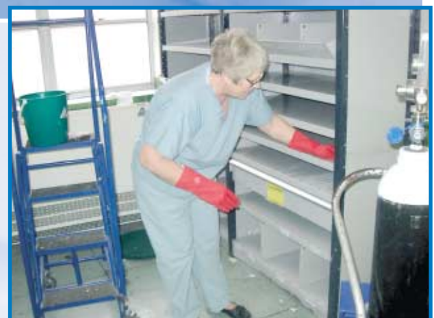
Medirest staff hard at work during the deep clean

None of this would have been possible without the dedication and support of staff. The Trust would like to thank our partners Medirest and contractors Spot and Drive Clean for their hard work during the deep clean.