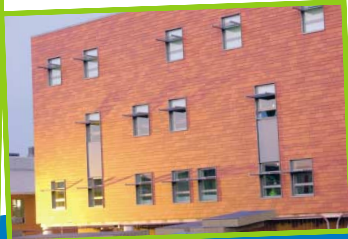
The new site is almost complete