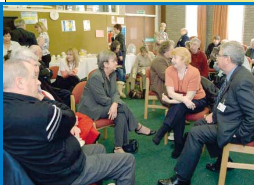
The Trust's dedicated volunteers share their experiences