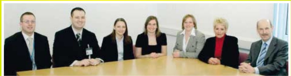
Members of the ESR Development Team

The Trust has formed a dedicated ESR Development team to support the design, development and implementation of ESR across the Trust.