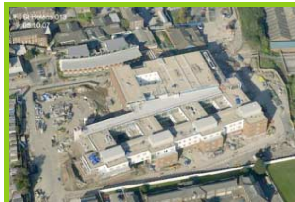
The new St Helens Hospital from the air

"The hospital has progressed so much in a short space of time, I will look forward to it being completed and handed over later this year."