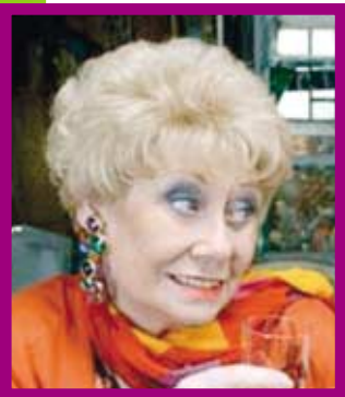
Coronation Street actress Liz Dawn suffers from COPD

A new community service for patients with respiratory illnesses has been launched by the Trust in partnership with Knowsley PCT.