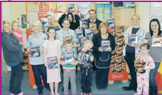
Our friends at Taylor Woodrow visit the Children's Unit to make a generous donation