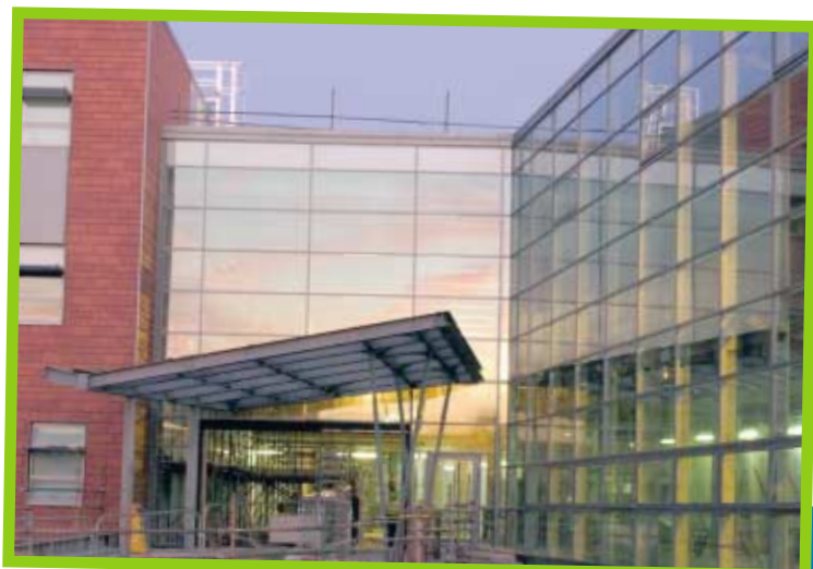
The impressive new entrance to St Helens Hospital