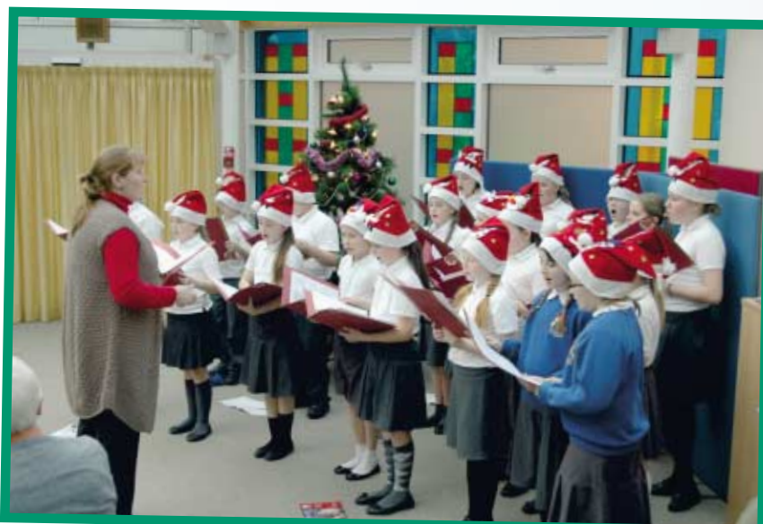
The children of Whiston Willis Community Primary School singing christmas carols!

With Christmas fast approaching it was time once again to hold the blessing of the crib service, in the Chapel at Whiston Hospital.