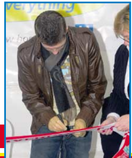
'Stevie G' signs a Liverpool FC scarf

Steven signed one of his famous red Liverpool shirts and a scarf, which will be displayed in the main entrance close to where the time capsule will be buried in the new hospital. He declined to accept an offer to sign for Sunderland FC which made him laugh a lot for some reason??!!