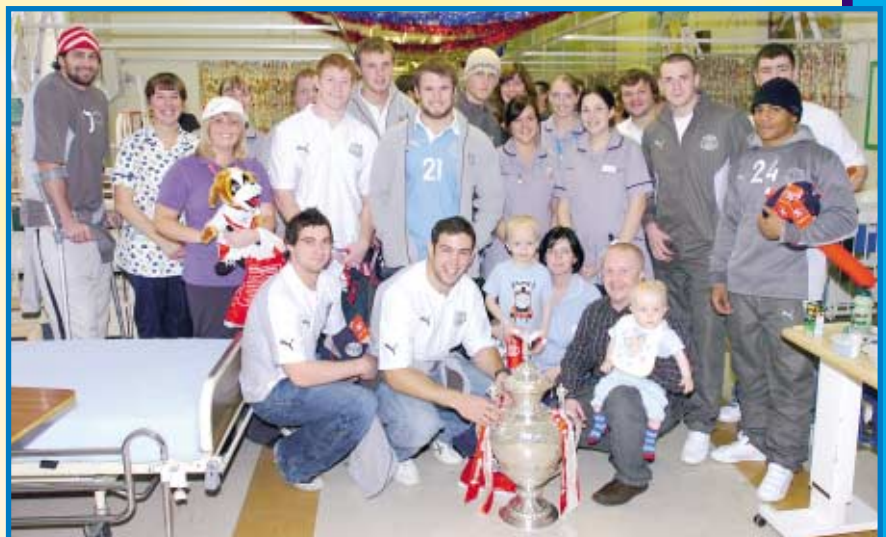
The children, relatives and staff have their picture taken with the Saints players and the challenge cup!!!

"We would like to thank all the players for coming to visit the children and helping to put a smile on their faces during their stay in hospital, I'm sure it will be a day the children and staff will remember for quite some time!"