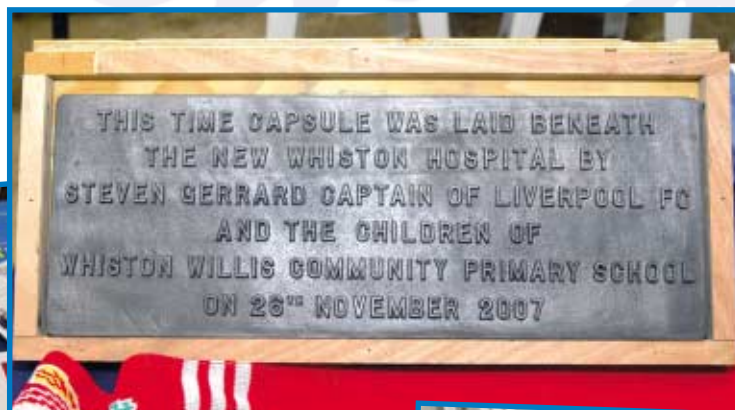
Time capsule lid with inscription and below some of the items which were also placed inside ready to be buried