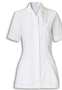
Nuclear Medicine Practitioner